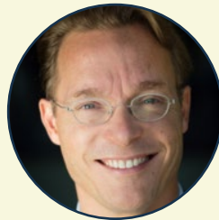
His Royal Highness Prince Jaime de Bourbon de Parme