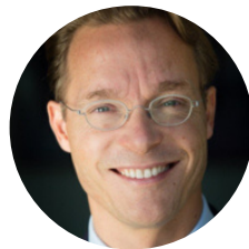
His Royal Highness Prince Jaime de Bourbon de Parme LEADERSHIP COUNCIL